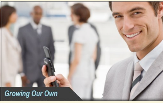
Growing Our Own