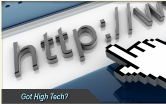
Got High Tech?

The Lincoln Trail Dynamic Business Accelerator (DBA) is dedicated to helping businesses get off to a successful start in the Lincoln Trail region. The DBA concentrates on nurturing companies with high growth potential, that have a potential for either a national or international presence, and can demonstrate a likelihood of standing on their own within a few years.